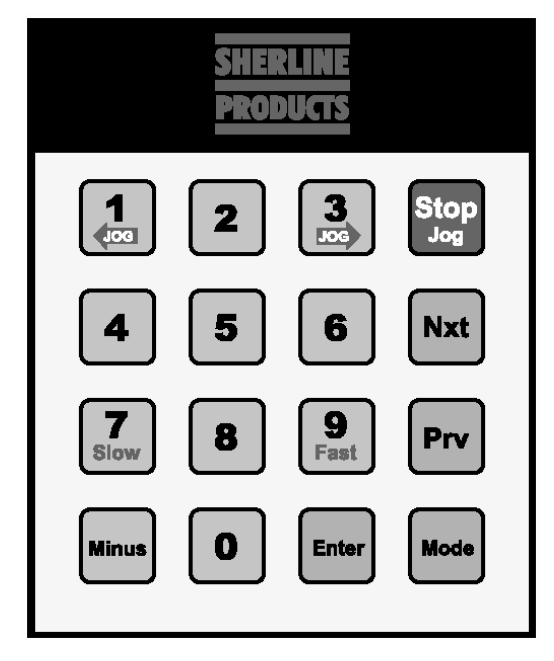
FIGURE 2—Layout of the keypad.

controlled by simple programs that you enter by using keys on the keypad.