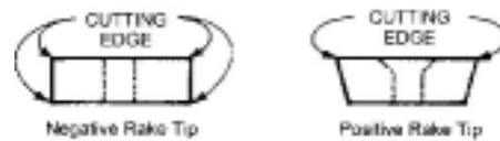
FIGURE 1—Negative and positive rake carbide cutting tips. Negative rake tips can be held upside down giving four cutting edges. Positive rake tips cut from one side only, but cut better. These boring tools have positive rake.

*A negative rake tool holder designed especially for Sherline lathes, P/N 7610, is now available. It is extremely rigid and allows the use of a 55° negative rake carbide tip which, because of the design of the holder, cuts like a positive rake cutter. The tool offers a cost advantage as well.